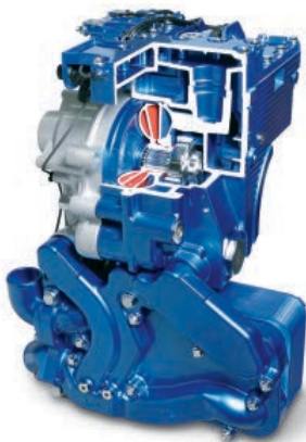
Voith Retarder 3250 for Renault Trucks

Economy, safety and driving comfort – this is what our hydrodynamic Retarders ensure.